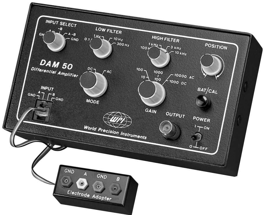
Fig. 1—The DAM50 is a differential amplifier.

NOTES and TIPS contain helpful information.