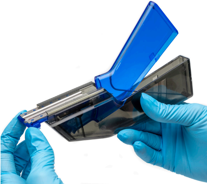
Fig. 2—Slide the staple cassette out of the stapler.