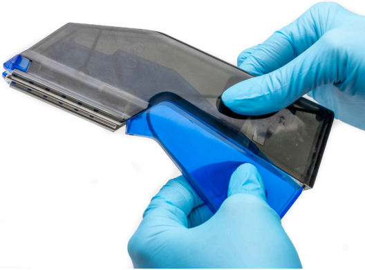
Fig. 4—Pinch the blue handle and latch it back into place to secure the staple cassette.