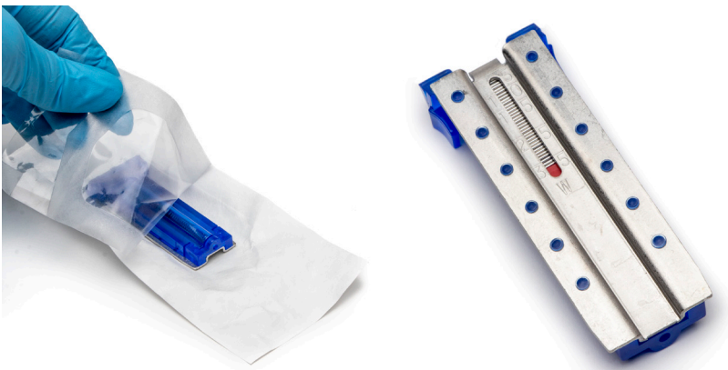
Fig. 3—Open the sterile cassette and insert it into the stapler until you hear a click.