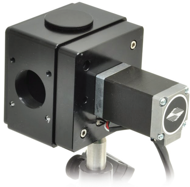
(Shown: Lambda VF-1)

VersaChrome® is a registered trademark of Semrock®